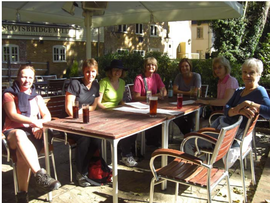
Photo of some of the ladies enjoying a lunch at Scotsbridge Mill Pub after the September 24 th walk.